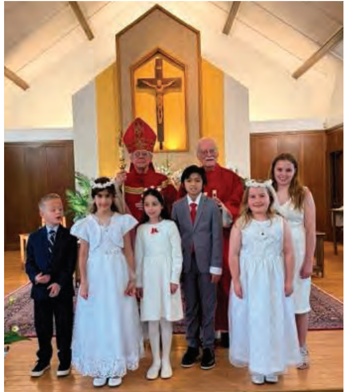
Many Blessings to all our students who made their Confirmation and First Communion.

May our gracious Lord continue to bless them and show-er them with His grace.