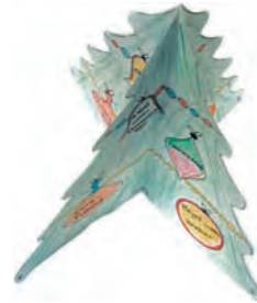
Different angles of completed tree.