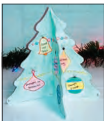
Weeks 1 & 2 together.