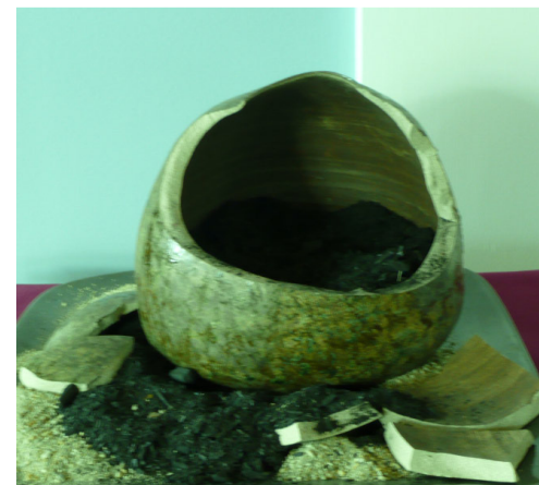
Liz Finnegan, Potter